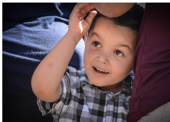
A Hand Up, Not A Hand Out!

What if you could make that experience even more community affirming by working along-side folks with very different backgrounds from your own—getting to know them and breaking down stereotypes, barriers and preconceptions? How nice would it be to volunteer and become friends with people from different ethnic and religious backgrounds than your own? If you are the kind of person who says, “Let there be peace on earth and let it begin with me,” you are going to want to participate in our Interfaith Build for Unity.