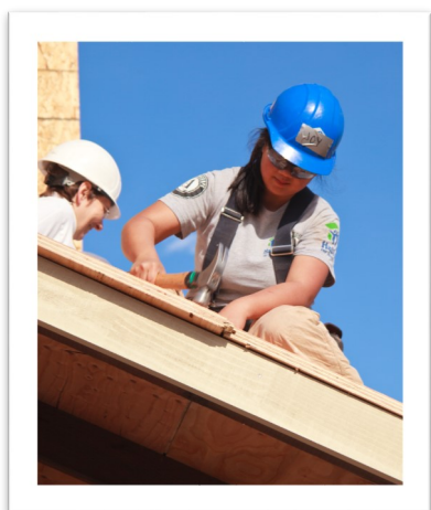
Volunteer working on construction site.