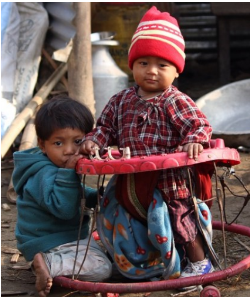
Children in Nepal playing outside.