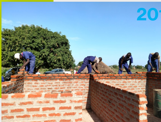
Volunteers laying brick housing in Uganda.

Thank you for hearing the whisper and answering the call to serve our families in El Paso County and beyond our borders. We are all God's children and we all deserve a decent place to live.