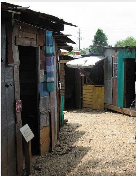
Traditional Nepalese housing.