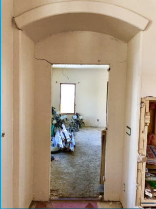
Growing cracks in the walls from the shifting foundation.