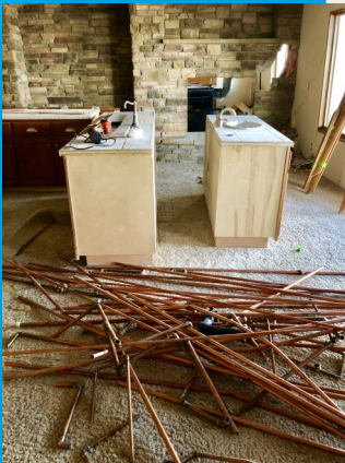
Cabinets and piping to be recycled.