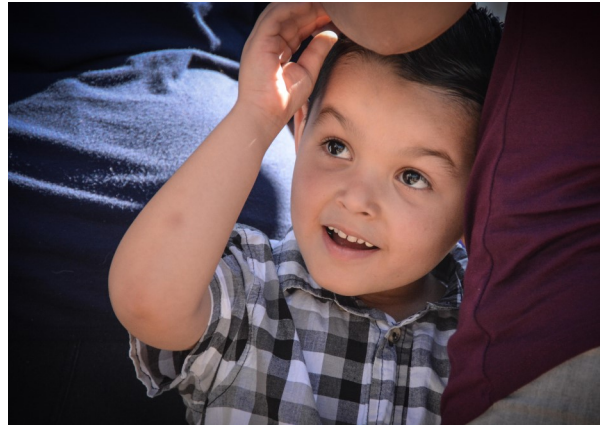
A Hand Up, Not A Hand Out!

We need every hand—YOUR hands—and every person—YOU—to help us with this effort. Call Iain at 719.475.7800 ext. 105 to find out more about how YOU can be the change you wish to see in the world!