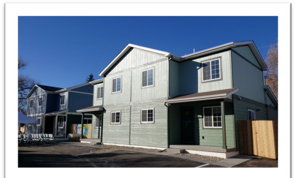
The four homes of Little Village Subdivision on Dale Street in Colorado Springs