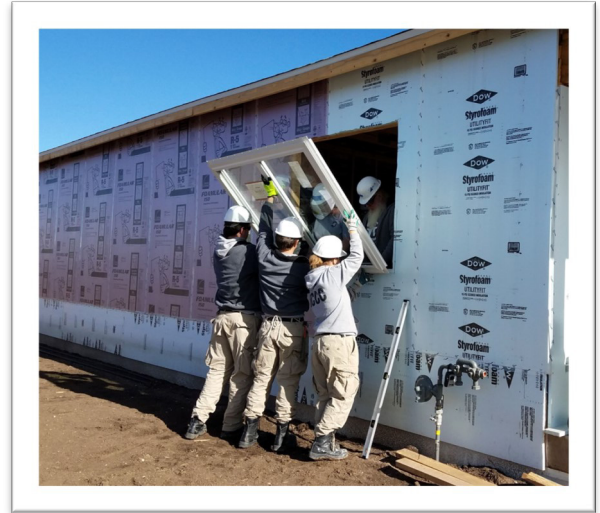
AmeriCorps NCCC Team installing a window on the 2nd Annual Veteran Home Build

Follow the next Team's journey with us. Check out our social media to watch as they help build a stronger El Paso County!