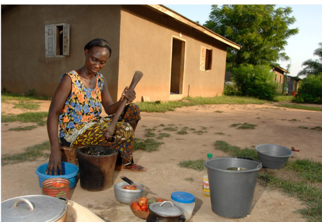
A Habitat homeowner in front of her home in Côte d'Ivoire