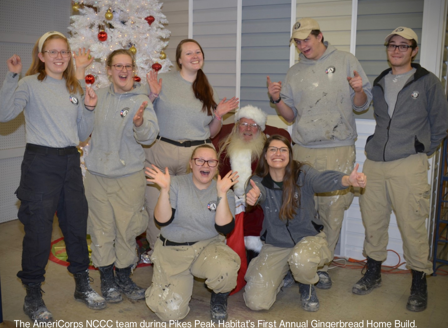
The AmeriCorps NCCC team during Pikes Peak Habitat's First Annual Gingerbread Home Build.