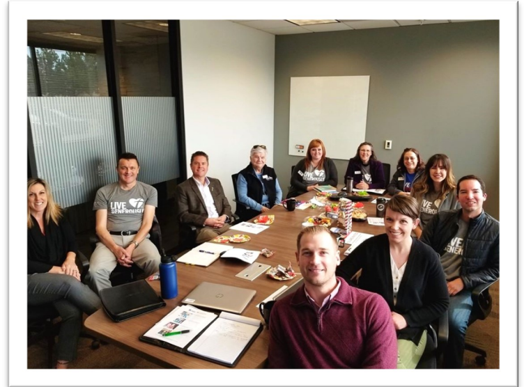
Staff from Habitat and Thrivent working together on the launch of the 2020 Thrivent Faith Build

Habitat Côte d'Ivoire builds houses using appropriate technology and local building materials. The houses are made of brick and mortar, with corrugated iron roofing sheets. Additionally, Habitat Côte d'Ivoire runs programs that promote water needs, sanitation, and hygiene, provide financial education, and provides housing for people with disabilities and low-income families.