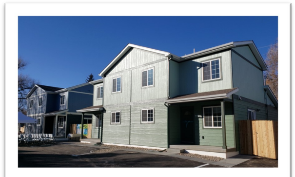
The four homes of Little Village Subdivision on Dale Street in Colorado Springs