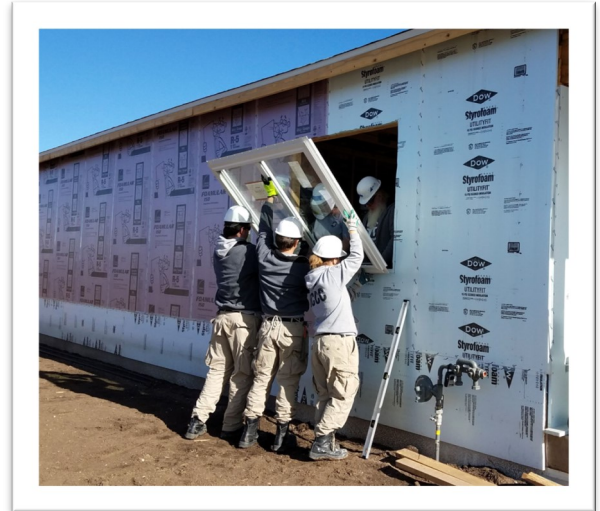
AmeriCorps NCCC Team installing a window on the 2nd Annual Veteran Home Build

Follow the next Team's journey with us. Check out our social media to watch as they help build a stronger El Paso County!