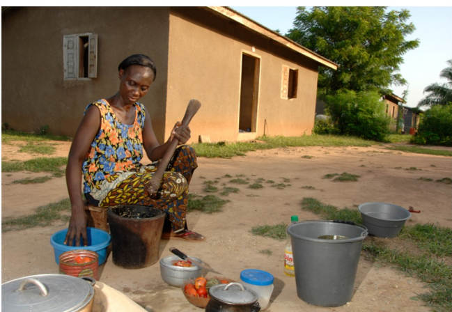
A Habitat homeowner in front of her home in Côte d'Ivoire