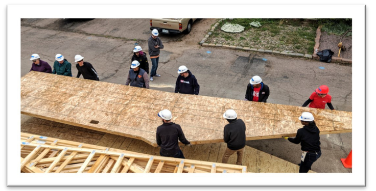
Adopt-A-Day group working together on a home

Adopt-A-Days (AAD) are opportunities for corporate or community groups to double their impact by participating in a team-building volunteer experience on our construction sites, and by supporting our partner families by covering the cost of building materials for that workday with a $2,500 or more donation. AAD groups receive many benefits including: lunch and Pikes Peak Habitat t-shirts provided to participants, priority volunteer booking, leadership invited to our annual donor recognition event, and recognition on our website and social media.