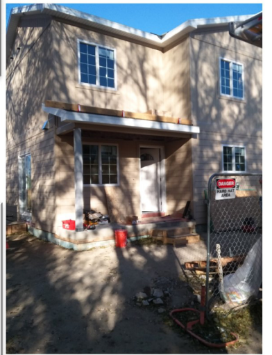
Dale Street build site nears completion