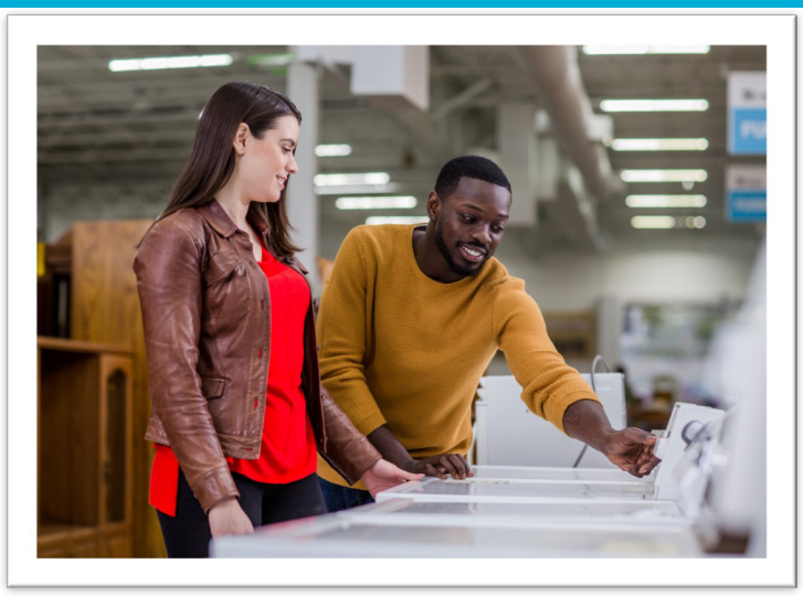
ReStore customers browse appliances for sale

"Our big goal is to open a second ReStore in northeast Colorado Springs. We'll be recruiting more volunteers and will continue to build new relationships to increase our inventory."