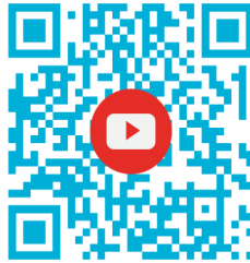
Scan to watch the Thrivent Faith Build Ground Blessing Video

Watch the video by visiting pikespeakhabitat.org/thriventbuild or by scanning the QR Code.