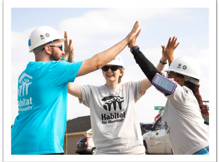
Bringing our community together with the Interfaith Build for Unity (picture taken pre-COVID-19)