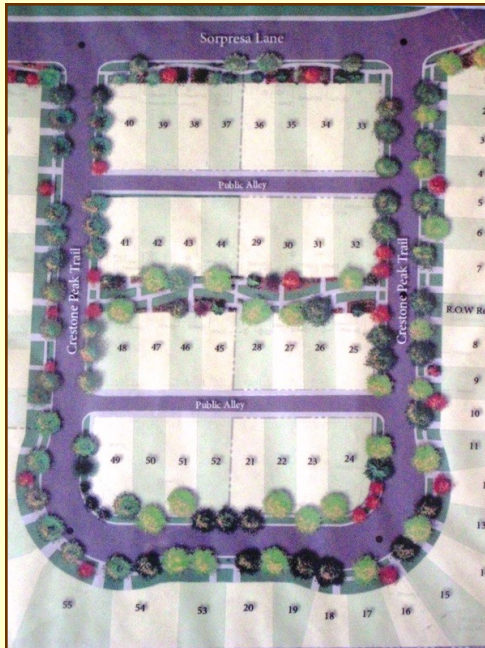
The above map shows the Woodmen Vistas neighborhood with the 36 lots on the right belonging to PPHFH. The 31 lots on the left belong to our partner in the project, the Rocky Mountain Community Land Trust.

Together, these four families represent the beginning of what Habitat hopes will be a thriving community. A neighborhood where children can play safely, parents can rest in financial relief, and families can grow strong.