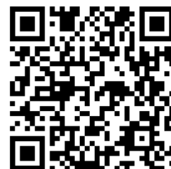
Scan the QR code to learn more about the Apostles Build!